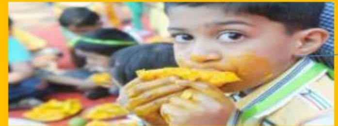
Boy eating mango