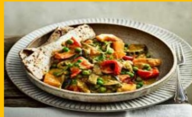
prepare vegetable curry